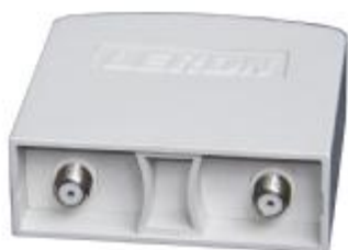
Appearance and installation dimension